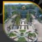
Main gate of Undana