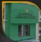
Animal Teaching Hospital